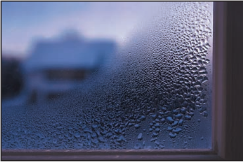
Condensation on the inside of a window-pane.