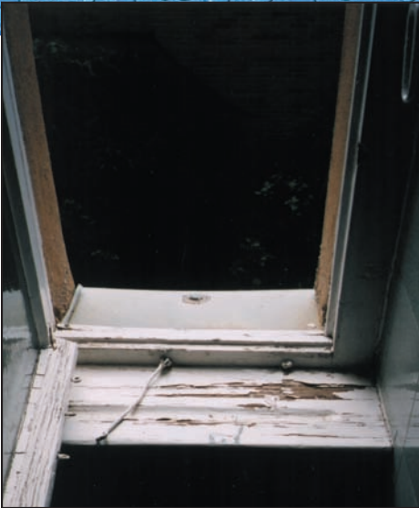
Leaky window – mold is beginning to rot the wooden frame and windowsill.

If you already have a mold problem – ACT QUICKLY. Mold damages what it grows on. The longer it grows, the more damage it can cause.