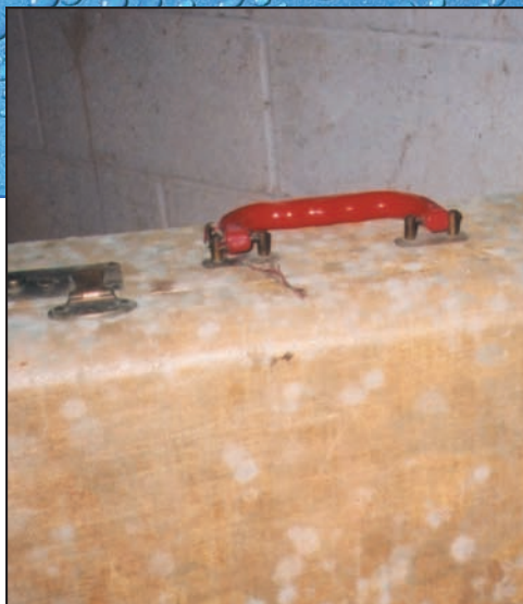
Mold growing on a suitcase stored in a humid basement.

It is important to take precautions to LIMIT YOUR EXPOSURE to mold and mold spores.