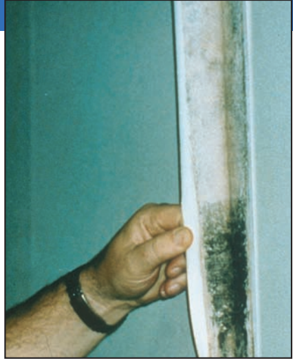
Mold growing on the back side of wallpaper.

Suspicion of hidden mold You may suspect hidden mold if a building smells moldy, but you cannot see the source, or if you know there has been water damage and residents are reporting health problems. Mold may be hidden in places such as the back side of dry wall, wallpaper, or paneling, the top side of ceiling tiles, the underside of carpets and pads, etc. Other possible locations of hidden mold include areas inside walls around pipes (with leaking or condensing pipes), the surface of walls behind furniture (where condensation forms), inside ductwork, and in roof materials above ceiling tiles (due to roof leaks or insufficient insulation).