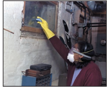
Cleaning while wearing N-95 respirator, gloves, and goggles.

■ Wear goggles. Goggles that do not have ventilation holes are recommended. Avoid getting mold or mold spores in your eyes.