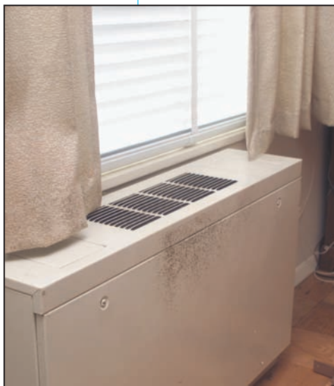
Mold growing on the surface of a unit ventilator.