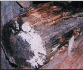
Mold growing outdoors on firewood. Molds come in many colors; both white and black molds are shown here.

Why is mold growing in my home? Molds are part of the natural environment. Outdoors, molds play a part in nature by breaking down dead organic matter such as fallen leaves and dead trees, but indoors, mold growth should be avoided. Molds reproduce by means of tiny spores; the spores are invisible to the naked eye and float through outdoor and indoor air. Mold may begin growing indoors when mold spores land on surfaces that are wet. There are many types of mold, and none of them will grow without water or moisture.