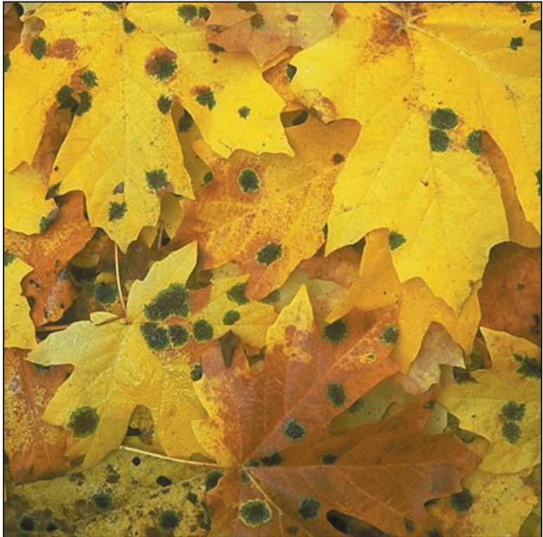
Mold growing on fallen leaves.

This document is available on the Environmental Protection Agency, Indoor Environments Division website at: www.epa.gov/mold