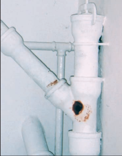
Rust is an indicator that condensation occurs on this drainpipe. The pipe should be insulated to prevent condensation.

Renters: Report all plumbing leaks and moisture problems immediately to your building owner, manager, or superintendent. In cases where persistent water problems are not addressed, you may want to contact local, state, or federal health or housing authorities.